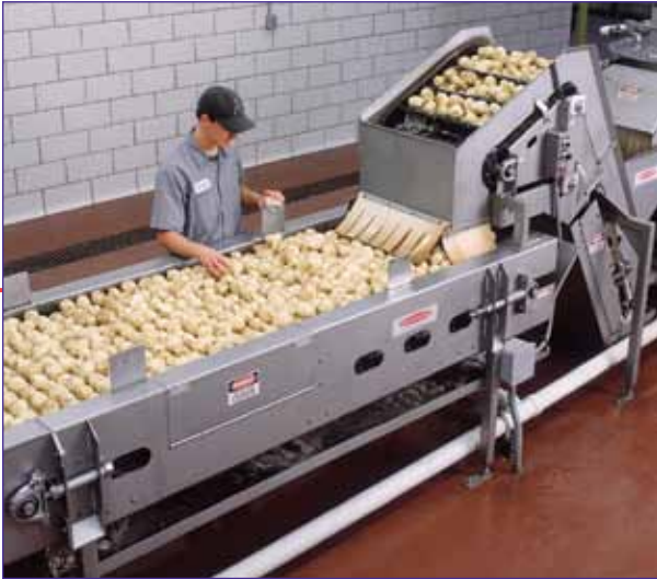
Inspection conveyors can be ordered with single or double lanes, movable cutting boards, and trim removal conveyors.

Choose the conveyor size and configuration that best fits your inspection process.